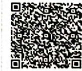
Registrar Pharmacy Council